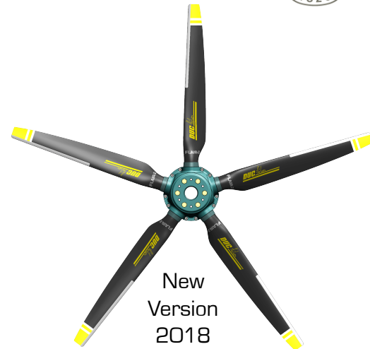
New Version 2018

EASA certified silent propeller for towing aircraft ROBIN DR400/180R